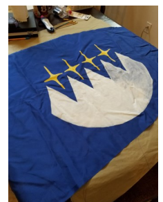
Hospitality Refurbishment in progress