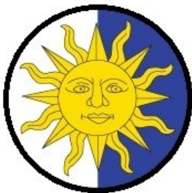
The populace badge for the Kingdom of Atenveldt

*FACT: award nominations do not necessarily get passed down between reigns– if a new reign begins consider resending your email!