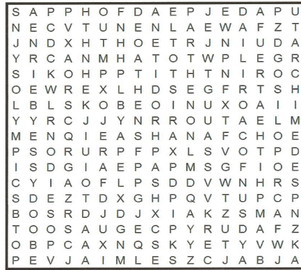
ANCIENT GREECE WORD SEARCH PUZZLE

ACROPOLIS ATHENS ODYSSEY PLATO AMPHITHEATRE CORINTH OLYMPICS POSEIDON APHRODITE GODDESS PARTHENON SAPPHO ARCHIMEDES HADES PERICLES SPARTA ARISTOTLE ILIAD PERSEPHONE ZEUS