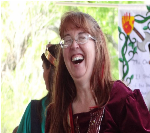
She has the greatest sense of humor! I love to hear her laugh!