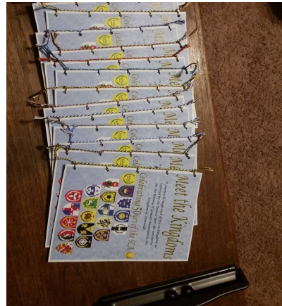
The hard work she put into on these books was amazing!