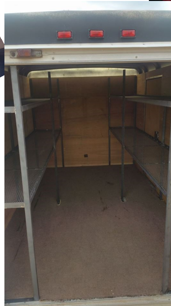
New trailer shelves!