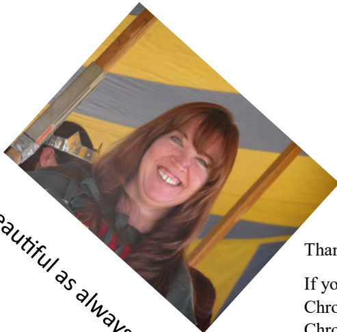
Beautiful as always!