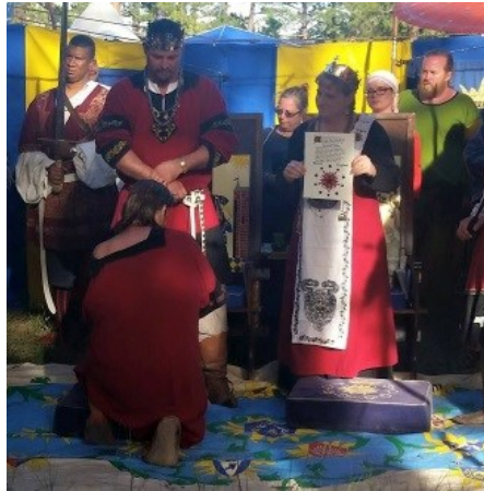
Hip Hip Huzzah to the Kingdom of Atenveldts' newest Lord...