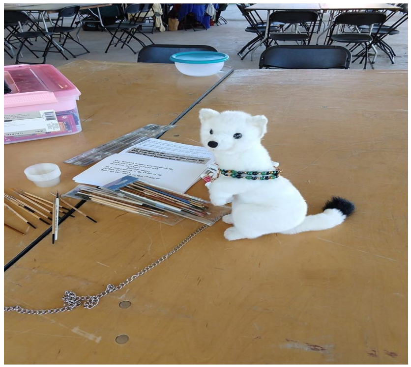
Our beloved mascot, Spot, taking a scribal class.

Baronial shenanigans! Spot has his own attendants attending him. They are Hootie, Captain of the Guard, Snickers, Lady in Waiting and Herbert the Duck, Court Herald.