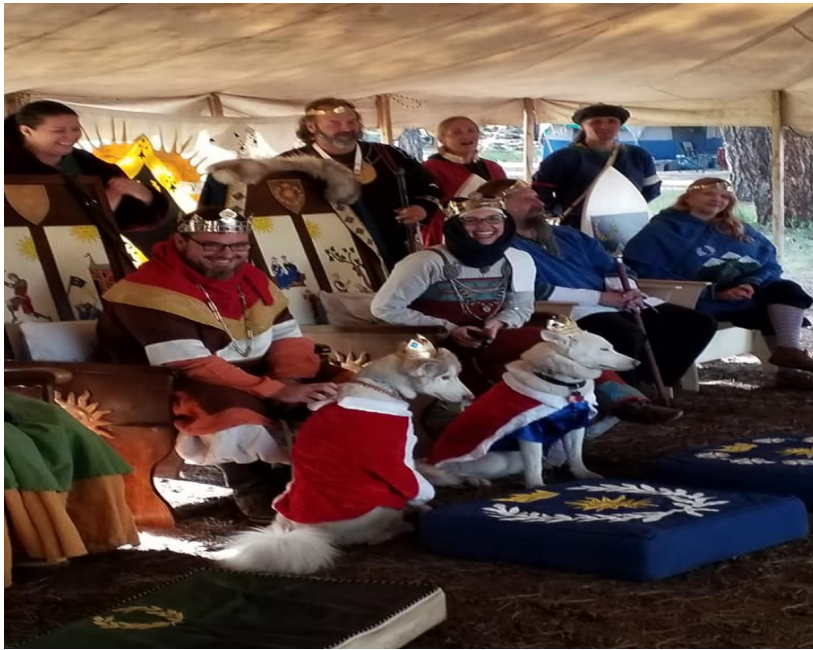
Their Majesties, the Royal Husky's, and Their Excellencies' at Evening Court.