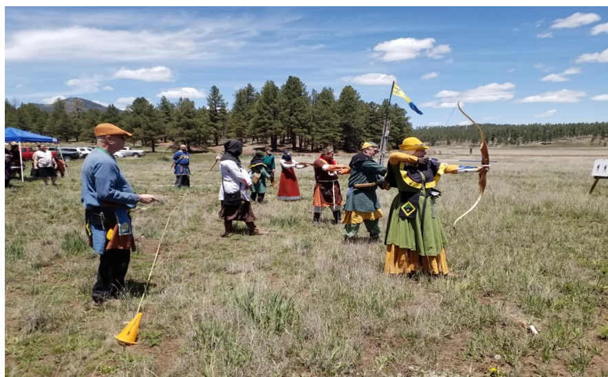
Their Majesties and Their Excellencies' opening the Archery range.