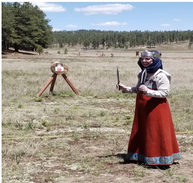
Her Majesty opening the Thrown Weapons range.