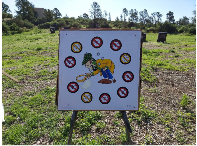
No poo Sherlock! I'm trying to stay PG 13ish