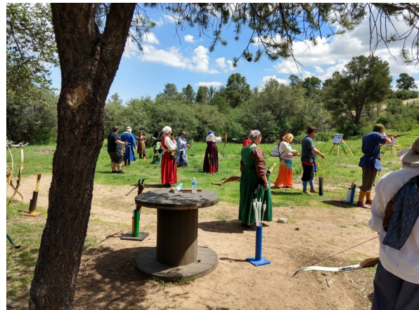
38 Populace from all over Atenveldt came to shoot the poo!