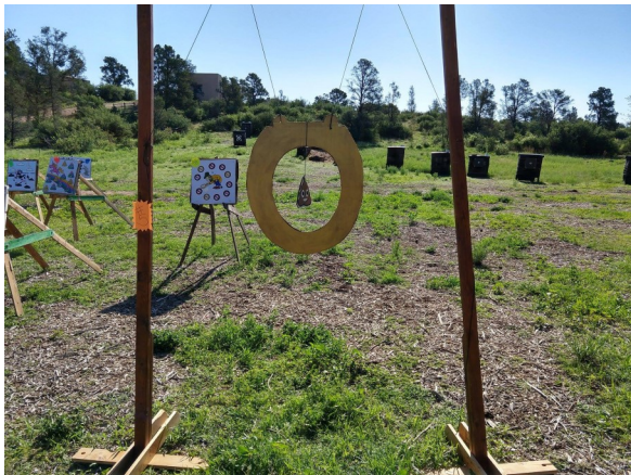
Of course there had to be a Golden Throne!