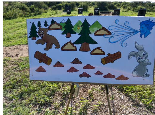
This is the answer to the age old question, does a bear poo in the woods? Yes, and so does a rabbit!