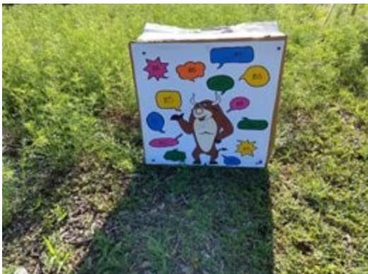
Shooting the bullpoo!