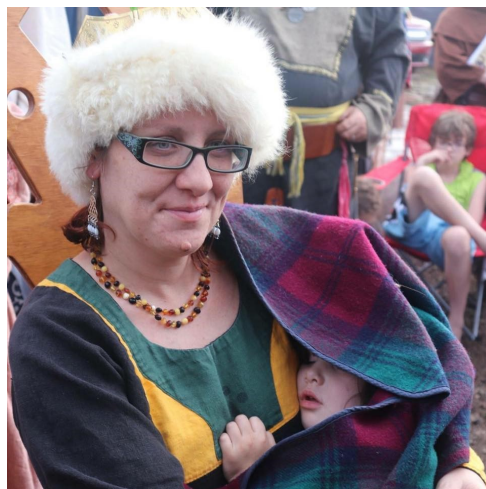
Too much playing and then sitting on Mom's lap for court means it's nap time.