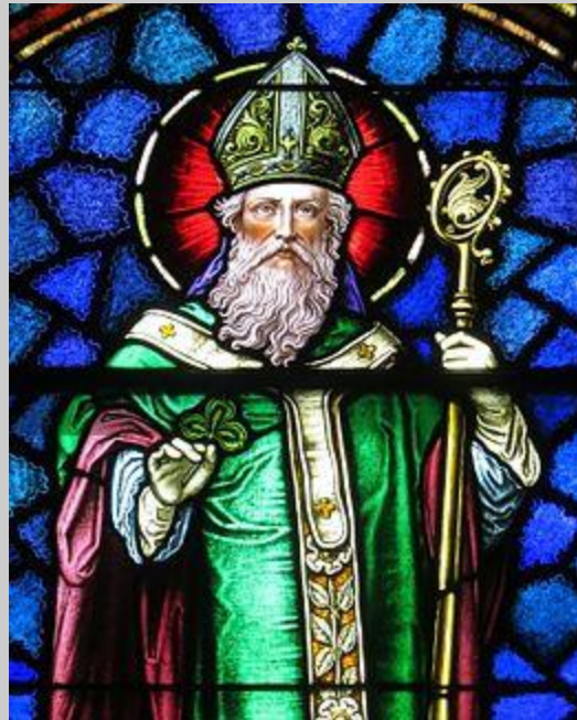
Saint Patrick Catholic Church (Junction City, Ohio) - stained glass, Saint Patrick - detail

Saint Patrick's Day is observed on 17 March, the supposed date of his death. It is celebrated inside and outside Ireland as a religious and cultural holiday. In the dioceses of Ireland, it is both a solemnity and a holy day of obligation; it is also a celebration of Ireland itself.