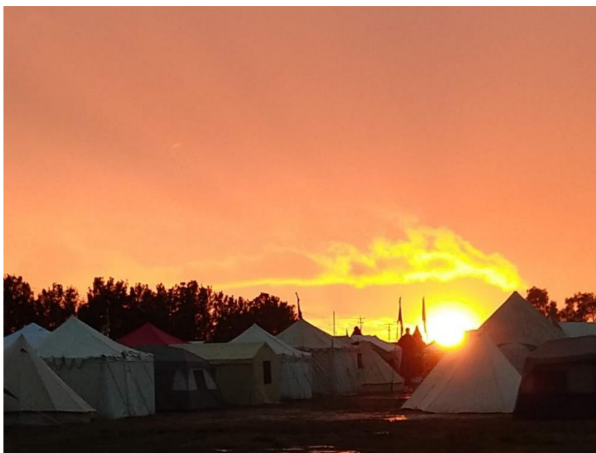
Photography: Leolin Blackwell (Shaun Prizio)