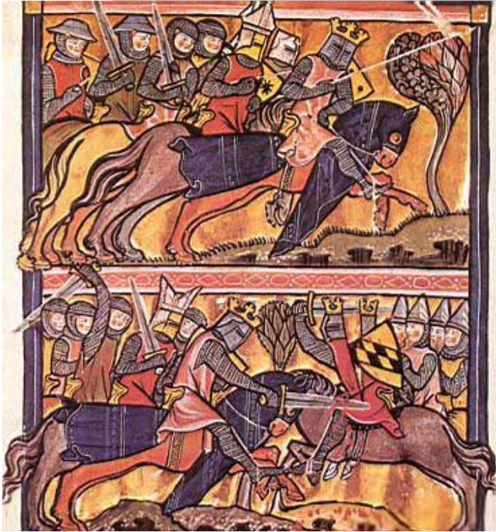
Der Stricker - Karl St. Gallen, Stiftsbibliothek, Ms. Vad. 302 II, vol. 35v, 13th century manuscript (ca. 1300)

actual height or weight, but since the average horse of the time was 12 to 14 hands (48 to 56 inches, 122 to 142 cm), thus a "great horse" by medieval standards might appear small to our modern eyes. The destrier was highly prized by knights and men-at-arms, but was actually not very common, and appears to have been most suited to the joust.