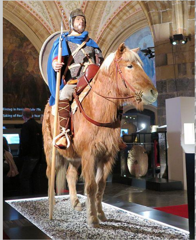
Carolingian warrior on a war horse (8th - 10th century) with lance, round shield, chainmail and spangenhelm in the Coronation Hall of the Aachen City Hall in June 2014 on the occasion of the exhibition "Charlemagne - power, art, treasures" to 1200. Death of Charles.)