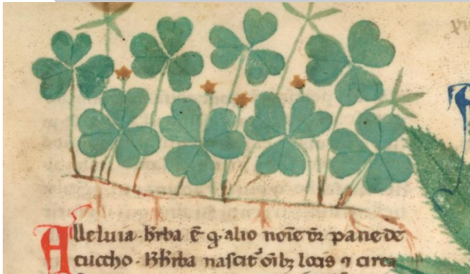
Miniature of an alleluia or wood sorrel plant, from an Italian herbal, c. 1280–1310, Egerton MS 747, f. 12r

was without protection, and he says that he was on one occasion beaten, robbed of all he had, and put in chains, perhaps awaiting execution.