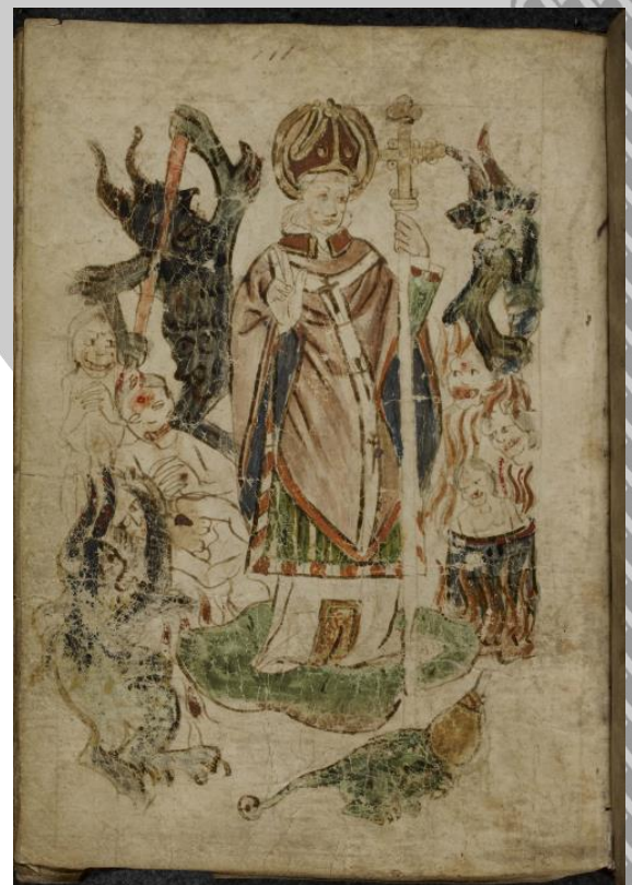
Depiction of St Patrick standing on a snake in Purgatory, from St Patrick's Purgatory : England, 1451, Royal MS 17 B XLIII, f. 132v

The absence of snakes in Ireland gave rise to the legend that they had all been banished by Patrick chasing them into the sea after they attacked him during a 40-day fast he was undertaking on top of a hill. This hagiographic theme draws on the Biblical account of the staff of the prophet Moses. In Exodus 7:8–7:13, Moses and Aaron use their staffs in their struggle with