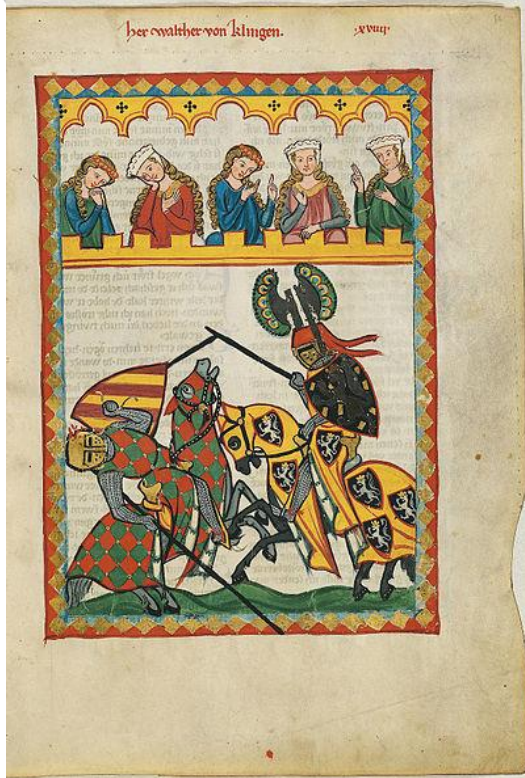
Depiction of a late 13th-century joust in the Codex Manesse. Joust by Walther von Klingen.