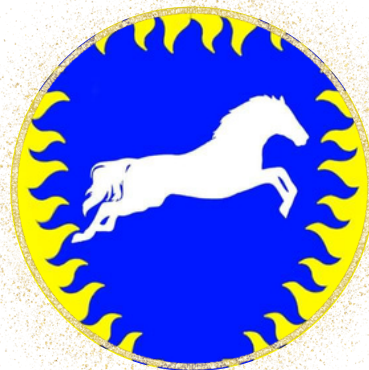
BARDIC CHAMPION LADY MOBILLIA DWN