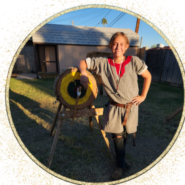
THROWN WEAPONS CHAMPION HAMISH THE HUNTER