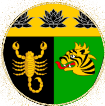
A&S CHAMPION FIREBALL