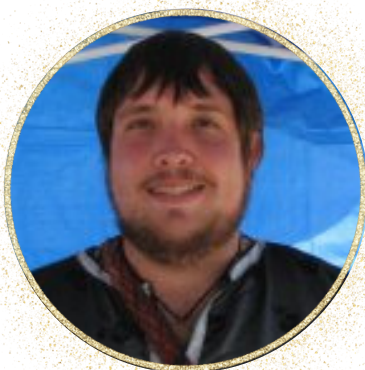
ARMORED COMBAT CHAMPION CHARLES THE BEAR