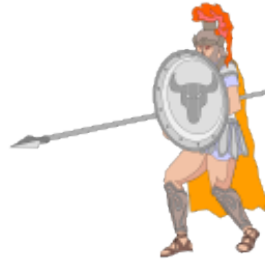
650 bc Sparta Rose to Power