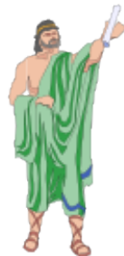
443 bc - 429 bc Pericles