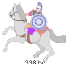
338 bc Phillip of Macedon