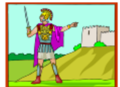
336 bc - 323 bc Alexander the Great