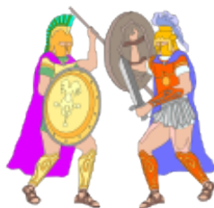
431 bc - 404 bc Peloponnesian War