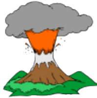
1600 bc Thera Erupted