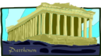
437 bc - 438 bc Parthenon was Built