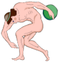
776 bc First Olympics