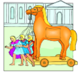
1194 bc - 1184 bc Trojan War