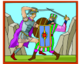
499 bc - 493 bc Ionian Revolts