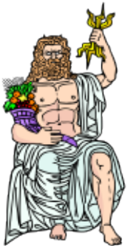
472 bc - 456 bc Temple of Zeus at Olympia built