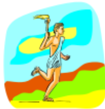
490 bc Battle of Marathon