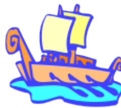
480 bc Battle of Thermoply and Battle of Salamis