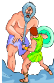
750 bc Homer Wrote the Illiad & Odyssey