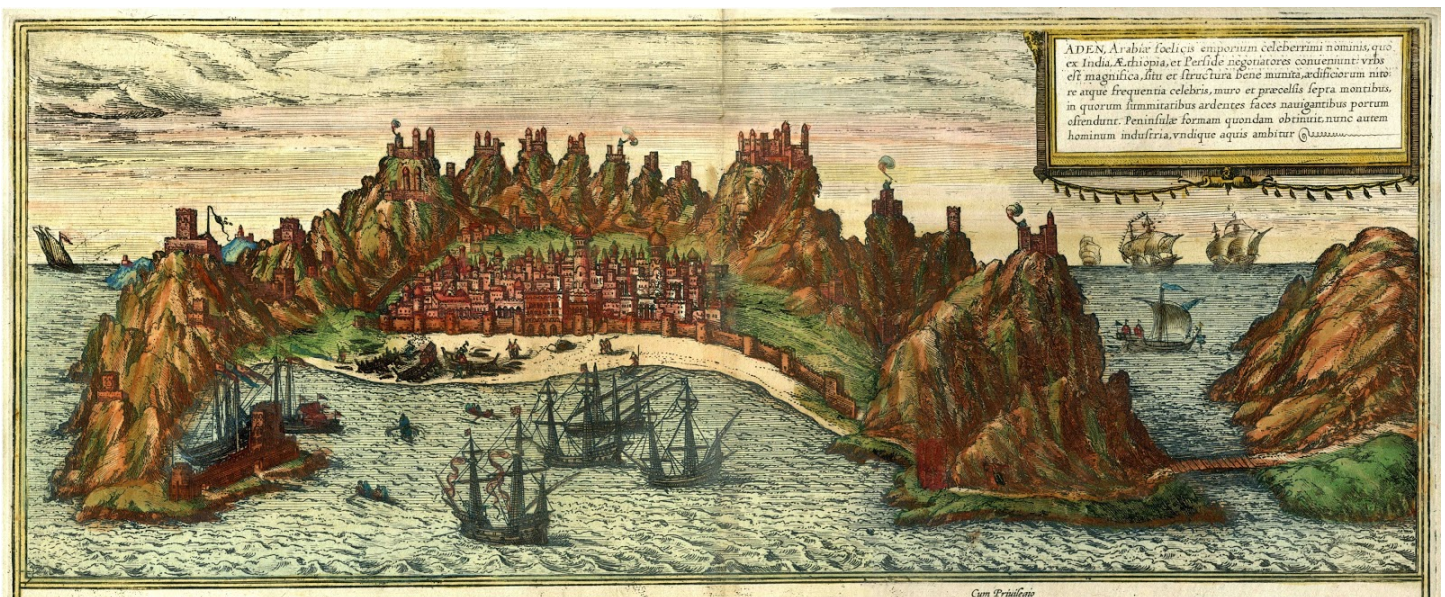
Aden, with Portuguese fleet. in Braun & Hogenberg. 1590

Palm Prints is a publication of the Barony of Atenveldt a branch of the Society for Creative Anachronism, Inc. Palm Prints is not a corporate publication of the SCA, Inc. and does not delineate SCA policies. Copyright(c) 2015 Society for Creative Anachronism, Inc. For information on reprinting photographs, pictures, or articles from this publication, please contact the seneschal listed on the Baronial Officership page who will assist you in contacting the original creator of the piece. Palm Prints is available online at www.baronyofatenveldt.org or can be emailed. You may request a printed copy from the seneschal.