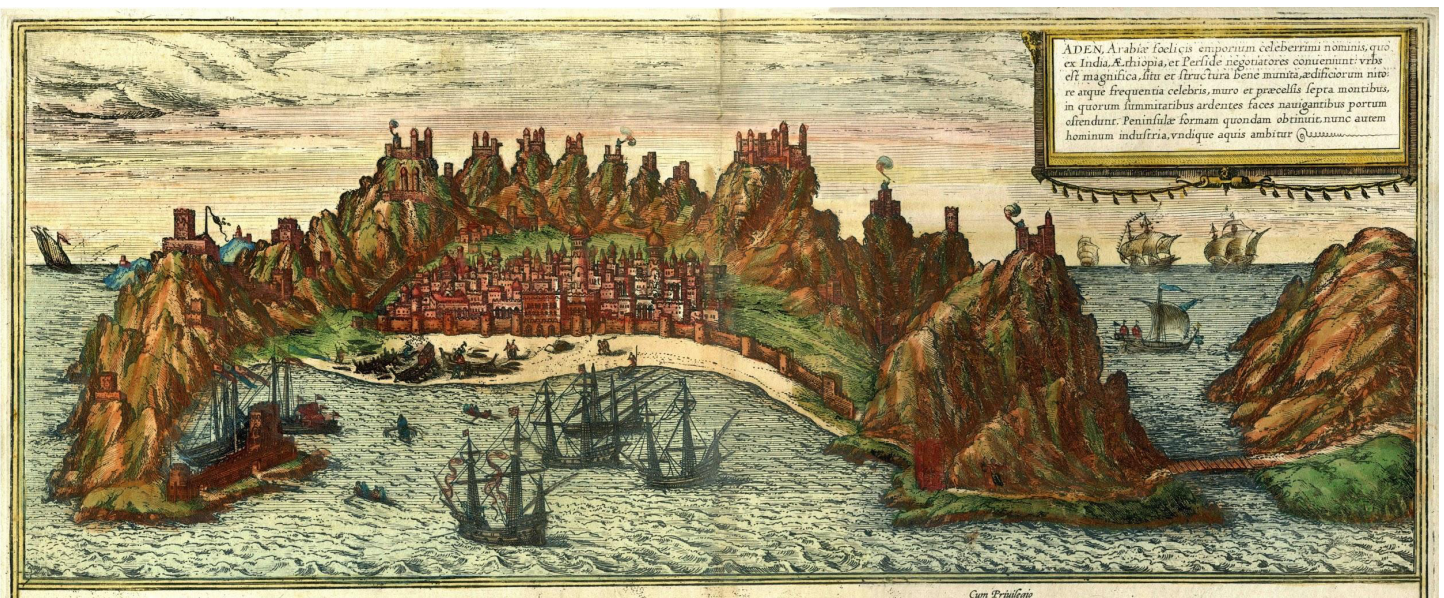
Aden, with Portuguese fleet. in Braun & Hogenberg. 1590

Palm Prints is a publication of the Barony of Atenveldt a branch of the Society for Creative Anachronism, Inc. Palm Prints is not a corporate publication of the SCA, Inc. and does not delineate SCA policies. Copyright(c) 2015 Society for Creative Anachronism, Inc. For information on reprinting photographs, pictures, or articles from this publication, please contact the seneschal listed on the Baronial Officership page who will assist you in contacting the original creator of the piece. Palm Prints is available online at www.baronyofatenveldt.org or can be emailed. You may request a printed copy from the seneschal.