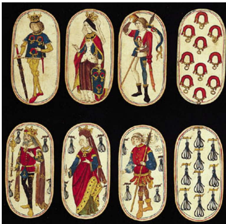
Cards from Southern Lowlands (Burgundy) ca. 1470-80, Metropolitan Museum of Art, the Cloisters Collection. Pasteboard with pen and ink, tempera, and applied gold and silver.

Cards like chess came to Europe through Spain though relatively late, in the thirteenth century. Cards were being played in Italy in 1320. In 1461 Edward IV forbade card playing except during Christmas. On 24 December 1484 Margaret Paston complained in one of her letters that cards were replacing caroling and other traditional yuletide customs. To this day our face cards are still decorated with English court costume of that century.